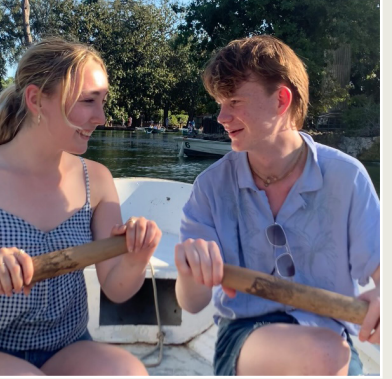
Rowing on the lake at the Villa Borghese Gardens in Rome

To escape the heat, we headed to Vernazza one of a series of pretty towns strung along Italy's west coast in an area known as the Cinque-Terre. It is an immensely beautiful place lined with colourfully painted houses perched on a rocky cliff overlooking the sea and surrounded by vineyards. This proved the perfect antidote to the hot and sticky city as we were able to relax and swim in the sea. We also took