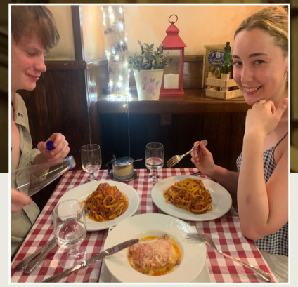
A delicious pasta supper on our first night in Rome