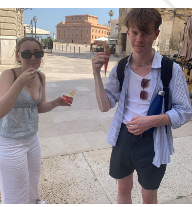
Our first gelatos in Bari melted very quickly in the 39 degree heat"