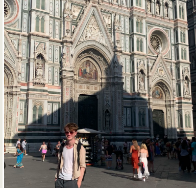
The decorative facade of Florence's Cathedral of Santa Maria Fiore

Palazzo Vecchio, and the Uffizi Gallery. Although Florence is extraordinarily pretty, the heat was truly unbearable especially at our hostel which was in an old convent without airconditioning. Notwithstanding, it was still one of our favourite places visited and, given the opportunity, we would all definitely return.